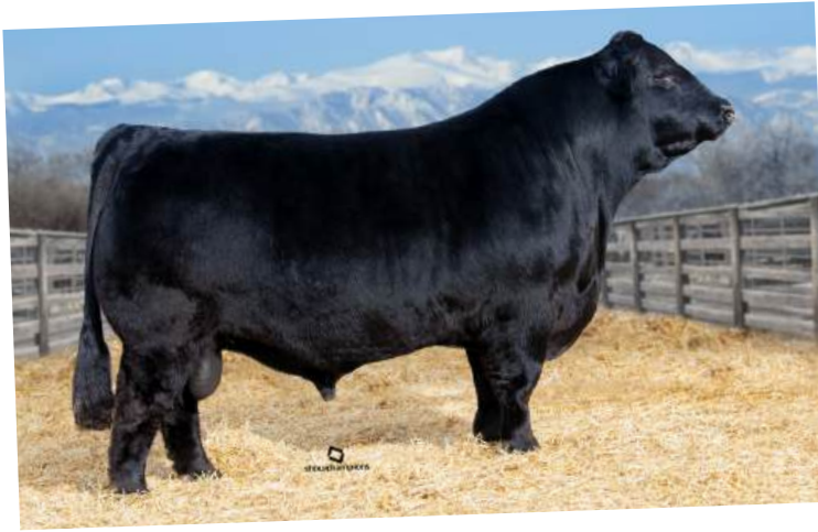
ELCX KINGS LANDING 599 D ET