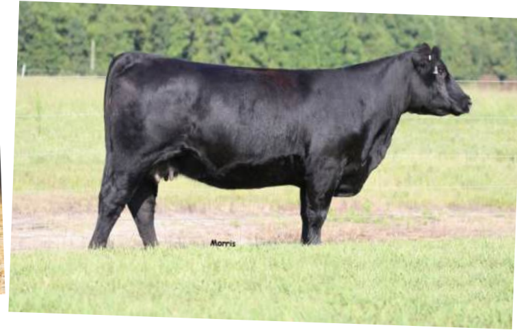
PBRS AUDREY 346A