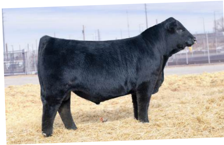
AHCC LANDSHARK 9624L