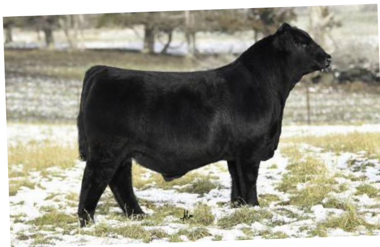
CELL LASTING IMPRESSION 3019L ET