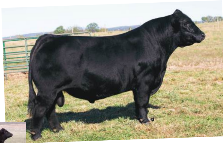
TASF CROWN ROYAL 960C ET