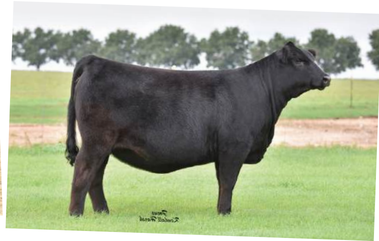
LFL GEORGIE GIRL 9013G ET