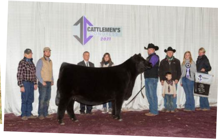
RATLIFF GOOGLE 911G ET