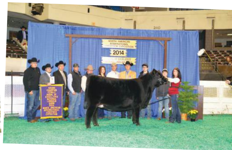
LLJB ABSOLUTE STYLE 3056A